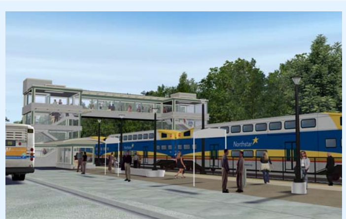
The Northstar Station at Coon Rapids-Riverdale is conveniently located on Northdale Blvd., south of Main St. (see reverse)

The Northstar Corridor is one of the fastest growing transportation corridors in the state. Northstar Commuter Rail will offer a fast, reliable and safe alternative to sitting in traffic. Starting late in 2009, Northstar will serve commuters via stations at Big Lake, Elk River, Anoka, Coon Rapids-Riverdale, Fridley and downtown Minneapolis, adjacent to the new Twins' ballpark — and with connections to the Hiawatha Light Rail Line and buses.